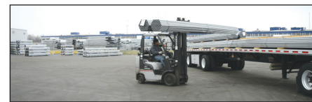
Under the planned expansion, major enhancements will be made to MTM’s Madison, Ind. facilities, two views of which are shown above.